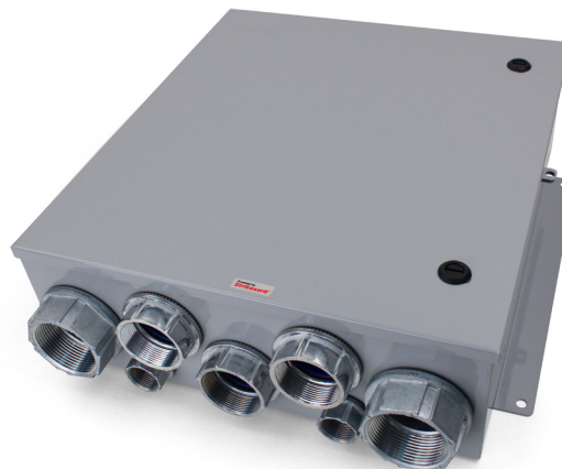
DC12-48-60-0-25E ships with Conduit Fittings installed