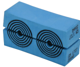
GM module with Multidiameter™