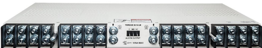
Fig. 2: 009-7001-0104B Rear View