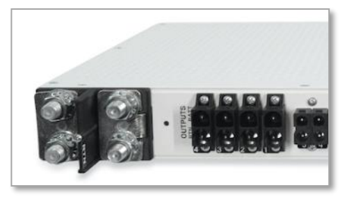
Stud Input/Lug Output