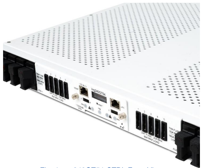
Fig. 4: nrg240GT54-CTRL Front View