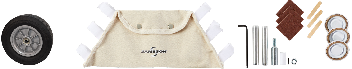
All-Terrain Wheel Big Buddy® Repair Kit