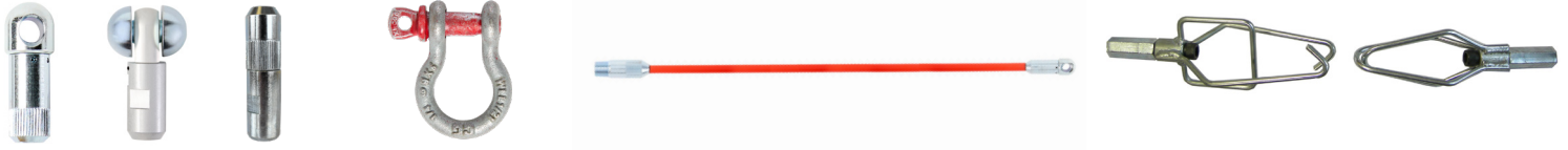
Swivel Eye Roller Guide Swivel Coupling Shackle Stinger Tip Splice Ferrule