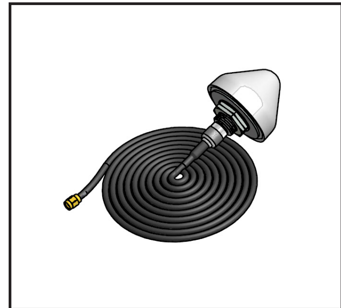
No Ground Plane Low Profile WiFi Antenna

471 Brighton Drive Bloomington, IL 60108