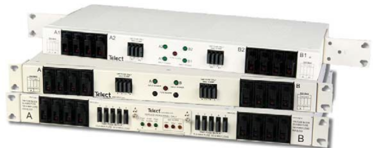
200A Dual 4/5 TPA/GMT with Bay Alarms, 009-8005-1404