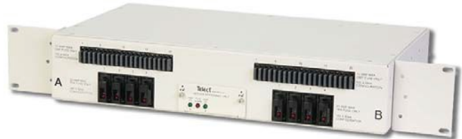
Fig. 4: 260A Dual 4/20 TPA/GMT Panel, 009-8005-0420