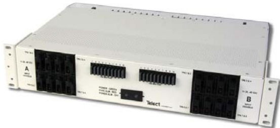
Fig. 3: 350A Dual 8/10 TPA/GMT Panel, 009-8005-0810

Used everywhere: Optical Transport fused typically around 30A, Universal Edge Routers fused in 30A to 50A range, Ethernet Switches fused typically around 40A and Servers fused in the 30A to 50A range