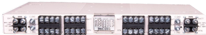
009-8004-0105 Rear View