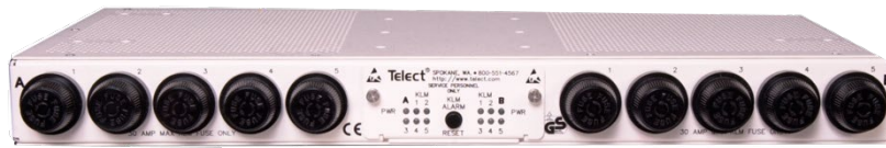
009-8004-0105 Front View