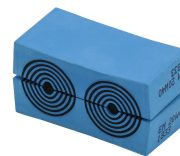
EM module with Multidiameter™