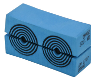
GM module with Multidiameter™